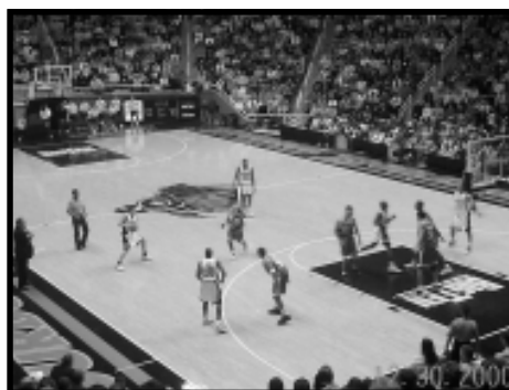
PURDUE VS. UCLA